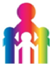
Bedford Borough Safeguarding Children Board