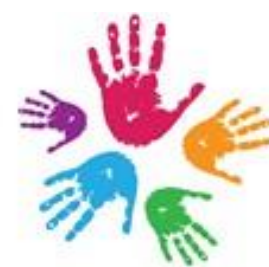
Central Bedfordshire Safeguarding Children Board